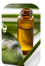
HOT OIL +add Php 50.00