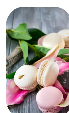
SWEET VANILLA +add Php 50.00