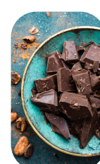
CHOCOLATE LOVER +add Php 50.00