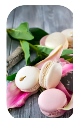
SWEET VANILLA +add Php 50.00